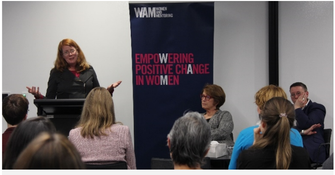
Justice for All – Just Not Women? WAM Event | Law Week 13-19 May

Women referred to the program through the justice system are matched with a volunteer mentor. The mentor provides emotional, social and practical support for the participants as they move through the court process and engage in sentencing outcomes. Once out of the court system, the mentor helps the client connect with community organisations to address the causes underpinning their interactions with the justice system.